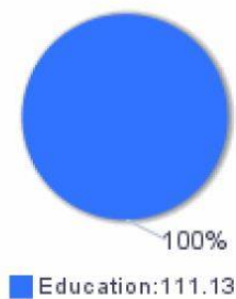
Table 1: MSYs by Focus Areas